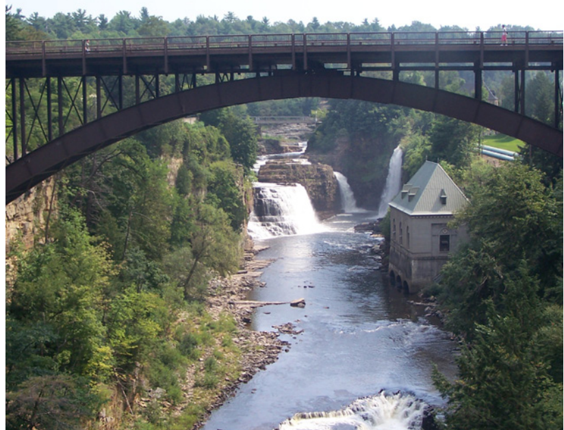
Ausable Chasm/ROOST-Lake Champlain Region