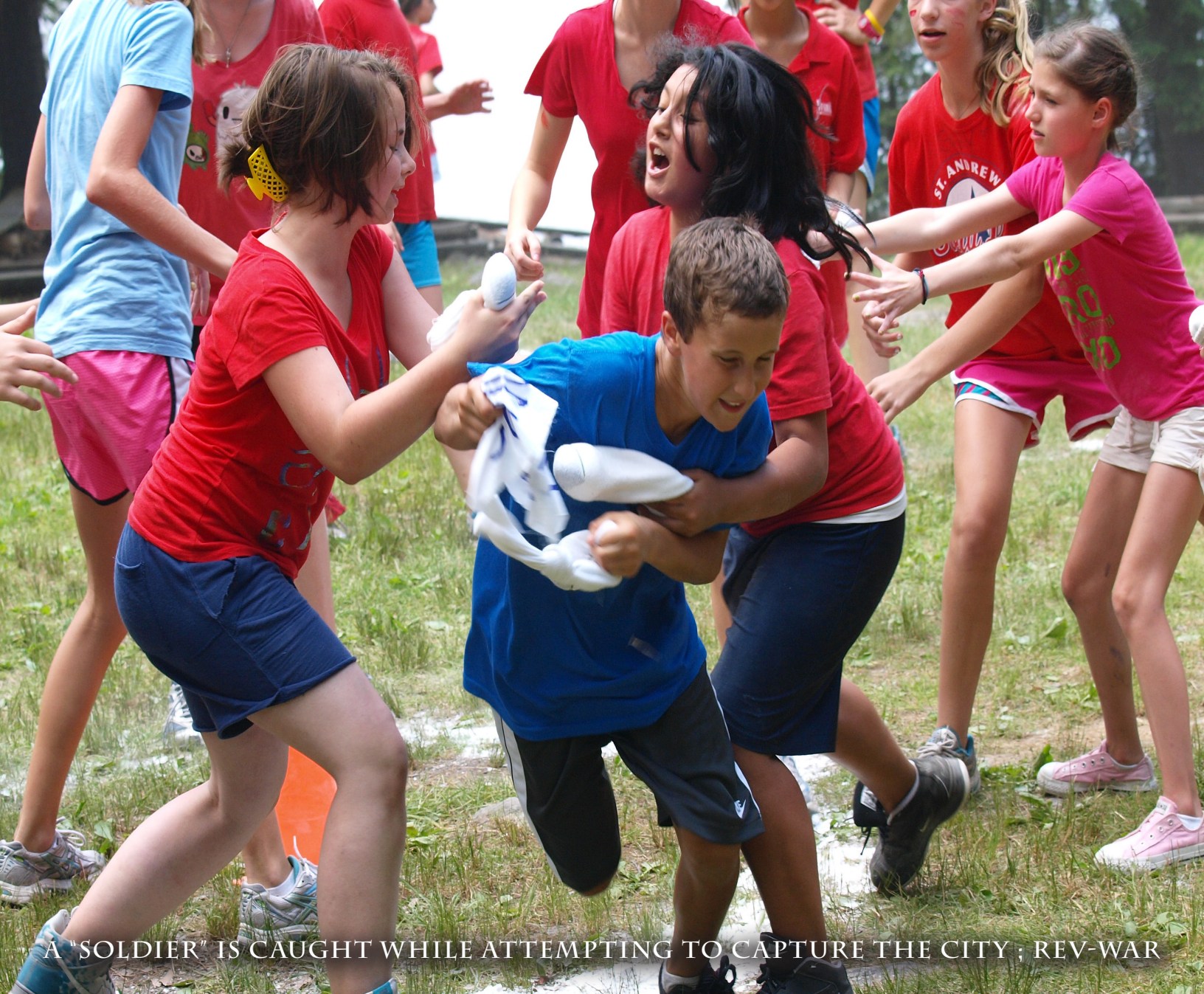
A "SOLDIER" IS CAUGHT WHILE ATTEMPTING TO CAPTURE THE CITY ; REV-WAR