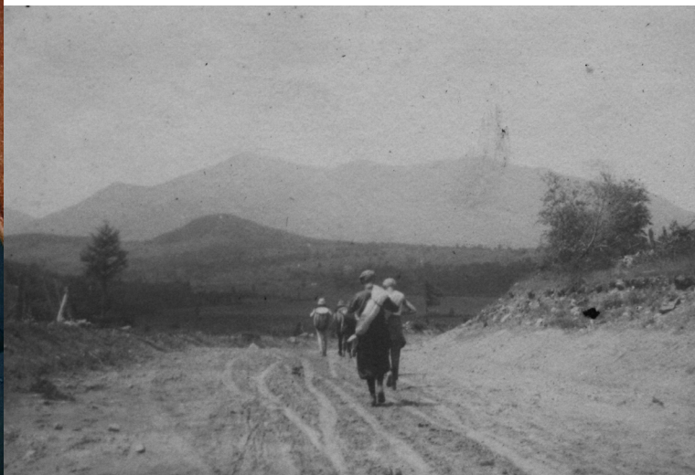
Campers, circa 1912, on their way to climb Whiteface mountain (background).

Each camper has the chance to realize a goal and feel a sense of accomplishment, whether it be showing off a talent at a Moonshiner event, hitting a bullseye in archery, hiking a high peak, winning a ribbon in a horse show, or becoming an Admiral in sailing. Whatever it may be, every day at Pok-O-MacCready is filled with prospects of learning, growing, and gaining a better sense of self.