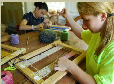
1812 HOMESTEAD CRAFT