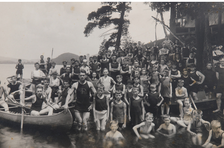
At the intermediate swim docks in 1909 - the fun was just beginning!

This ingenuity extends to every aspect of camp so that no matter what the weather or what you're doing, a day at Pok-O-MacCready will be filled with energy, excitement, and fun!