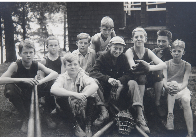
Throughout its century-old history, Pok-O-MacCready has always been a place to build lasting friendships.

Pok-O-MacCready is truly a second home and a second family - one that spans the country and the world. Since its inception, campers have come from a variety of nations including Venezuela, Germany, Spain, Italy, Egypt, Mexico, Israel, France, Singapore, and the United Kingdom.