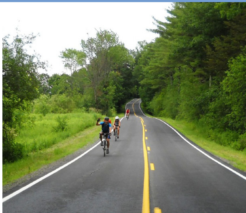
ROOST-Lake Champlain Region

Motorists and bicyclists share scenic roads. Use caution on narrow, winding or unpaved roadway. Follow traffic laws and ride safely. Bicycles are vehicles by law and have the right to use public roads. You are responsible for operating your bicycle under all conditions.