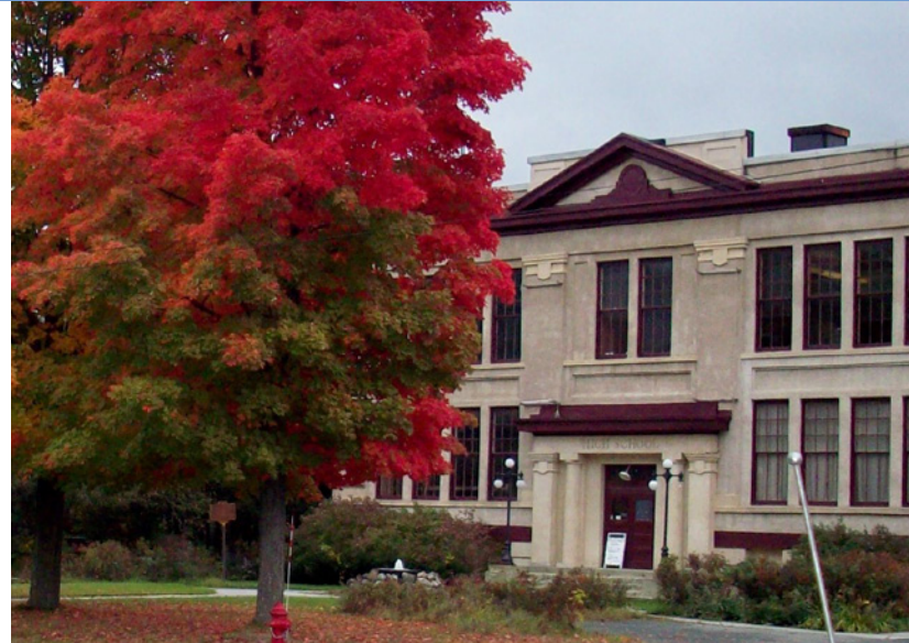
Adirondack History Museum