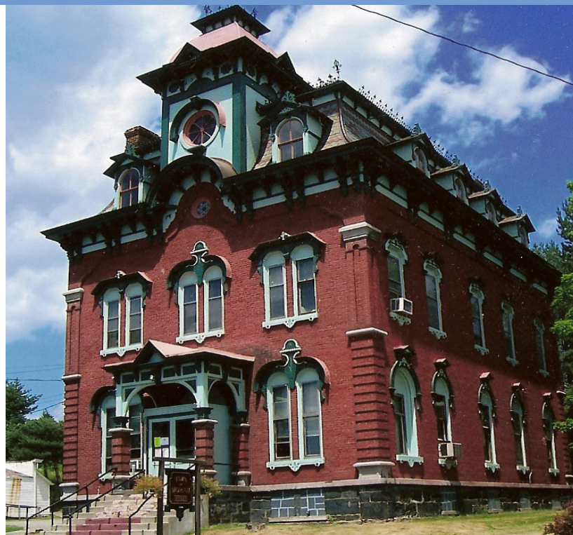
Moriah Town Hall