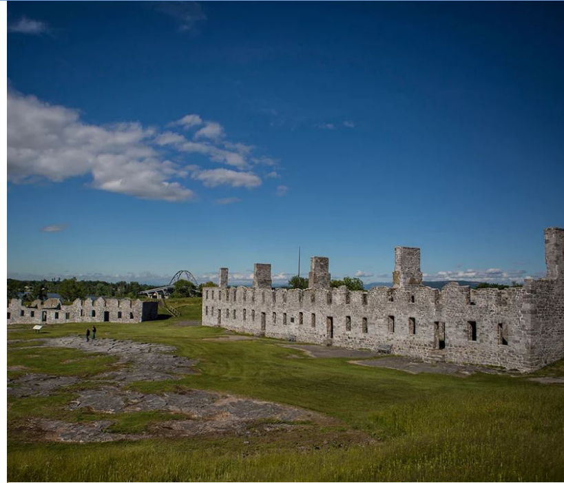
Crown Point State Historic Site

Motorists and bicyclists share scenic roads. Use caution on narrow, winding or unpaved roadway. Follow traffic laws and ride safely. Bicycles are vehicles by law and have the right to use public roads. You are responsible for operating your bicycle under all conditions.