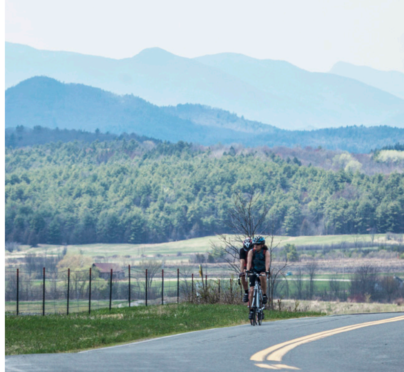
ROOST-Lake Champlain Region